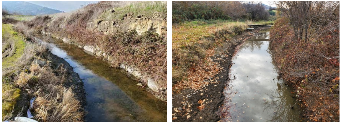
Site 1: Eagle Mill Road Site 2: Belmont Road Several leaks in these locations have been identified. The loss of water is estimated at 210 acre feet annually.

There are two sections of the Talent Main Canal where several leaks have developed. Site 1 is located near Eagle Mill Road just northwest of the City of Ashland, and Site 2 is near Belmont Road in the City of Talent. The usual remedies of cutting brush, coring and slipping the canal prism were successful for short periods of time; but inevitably the leaks would return. The District desires a more permanent solution and proposes to line these sections, totaling 1,770', with 445 cubic yards of shotcrete reinforced with Fibermesh® 150, homopolymer polypropylene multifilament fibers. Fibermesh® inhibits and controls the formation of intrinsic cracking, reinforces against impact forces, abrasions and the effects of shattering forces. The reinforced shotcrete will be more durable and resistant to water migration.<sup>2</sup> The installation of shotcrete with Fibermesh prevents seepage through the earthen channel and will improve the efficiency and effectiveness of the operation of the canal.